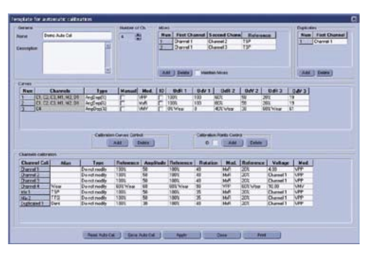
Analysis auto-calibration screen

The Apollo software has also been designed to use a user defined indications table. In this table the user defines the name of the indications, associated three letter code for each indication, which indications may require a secondary review, as well as those indications where only the tube information and three letter codes are required.